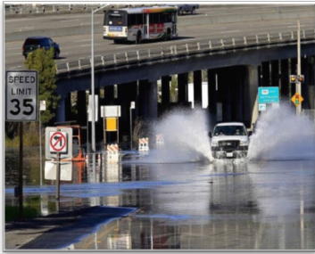
Sea Level Rise