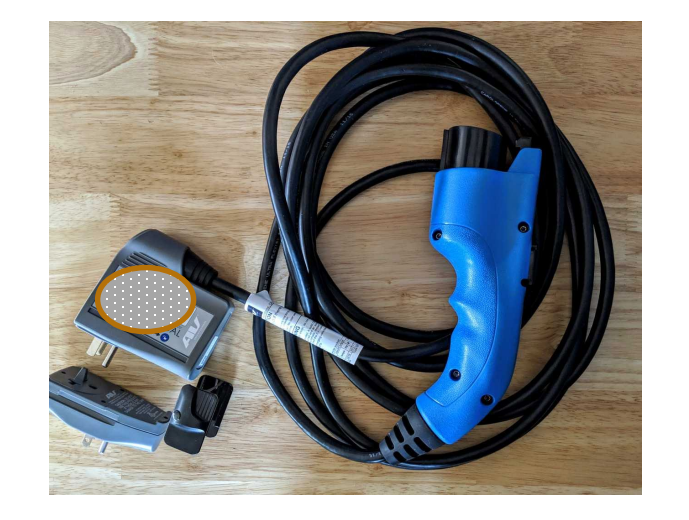
Portable Charger switches between 120V and 240V

Level 2 16-Amp with NEMA 14-30 receptacle